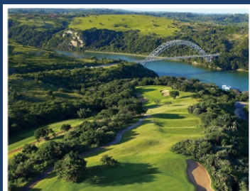
5th Hole Par 4