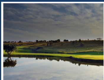
16th Hole Par 5

Sun International are proud to bring you the 2015 Wild Coast Sun Challenge. You are invited to play on the Wild Coast, San Lameer & Southbroom golf courses, where you are guaranteed to be entertained and enjoy the excitement of the challenge.