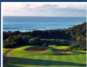
1st Hole Par 4